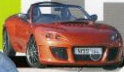
MURTAYA 265bhp, 4x4 GRIP & GO!