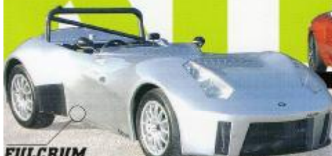
FULCRUM Supercharged Toyota power ROCKETSHIP FOR THE ROAD