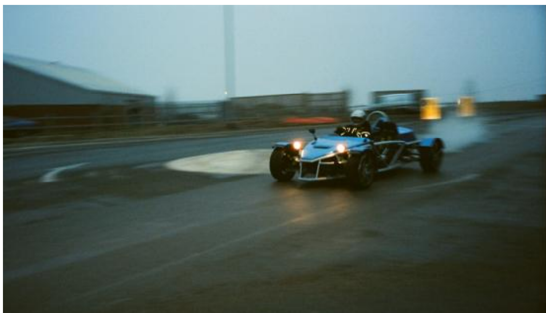
Rocket Zonta leaving MEV workshop